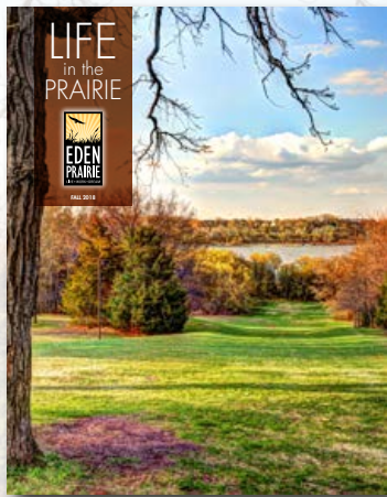
On the Cover: Staring Lake

Eden Prairie Players Present: A Collection of One Acts 7:30 p.m. Sept. 14–15; 20–22 2 p.m. Sept. 16, 23 Riley-Jacques Barn