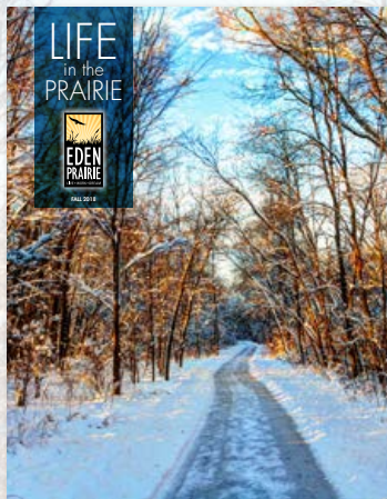
On the Cover: Staring Lake Trail