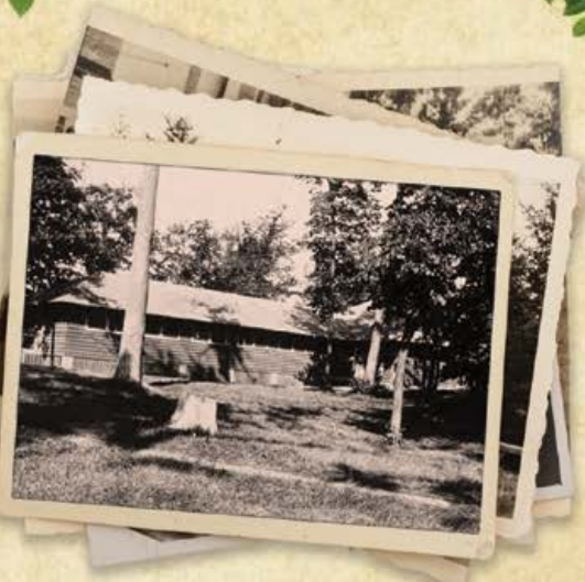
Location: 6350 Indian Chief Road Current Use: Camp Eden Wood