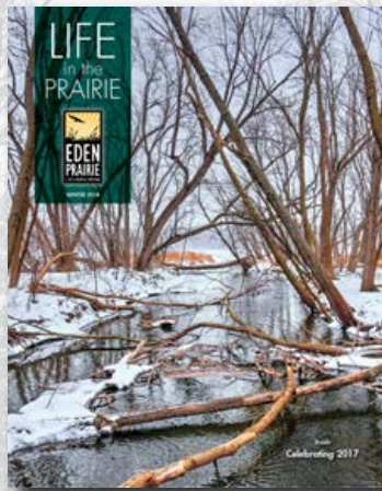
On the Cover: Staring Lake