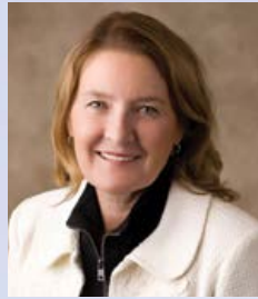
Mayor Nancy Tyra-Lukens