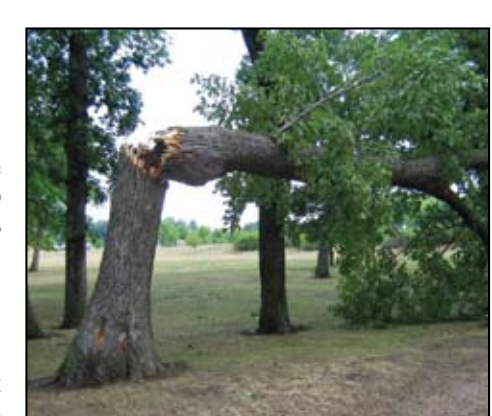
The storms of Aug. 11 damaged several trees at Riley Lake Park.

Environmental Wood Supply, a company that specializes in wood recycling, collected all the August storm leftovers, including some trees infected with Dutch elm disease. All of the material was chipped and loaded into 100-yard trailers before being taken to a wood recycling center in St. Paul.