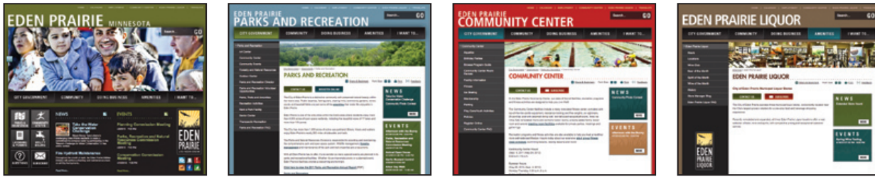
The new City website design also features branded theme pages for the Parks and Recreation Department, Community Center and Edén Prairie Liquor stores.