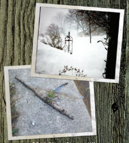
2011 Photo Contest Winners

Visit edenprairie.org for more information.